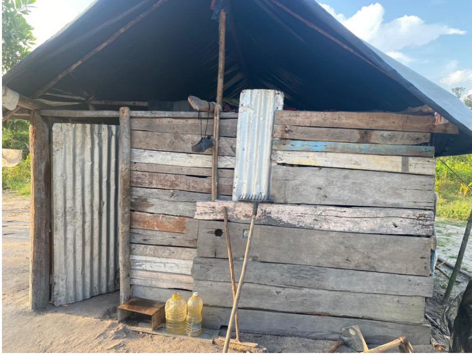
Image 3: Depicting southern end of camping structure which measures 9ft consisting of the sole entrance/exit door.