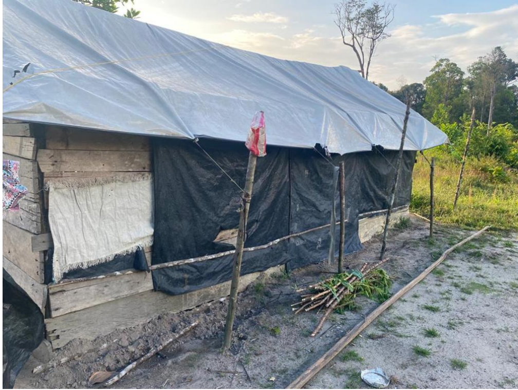
Image 5: Depicting eastern end side of camping structure which measures 18ft.