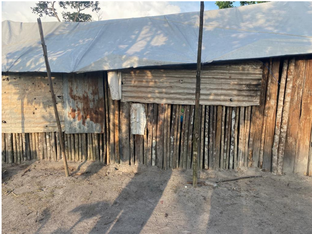
Image 6: Depicting western end side of camping structure which measures 18ft.