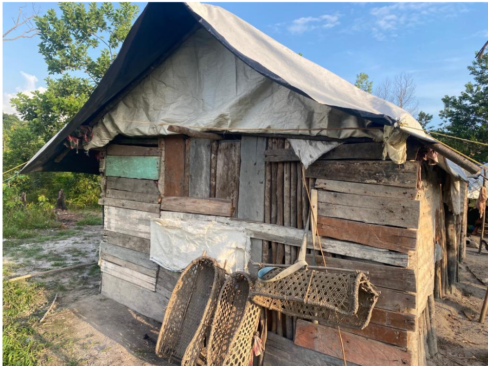
Image 4: Depicting northern end of the camping structure which measures 9ft.